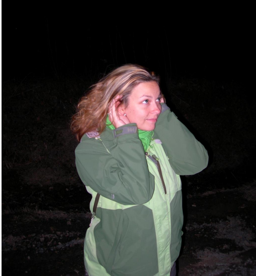
Figure 2. Disposition of hands to increase hearing capacity.